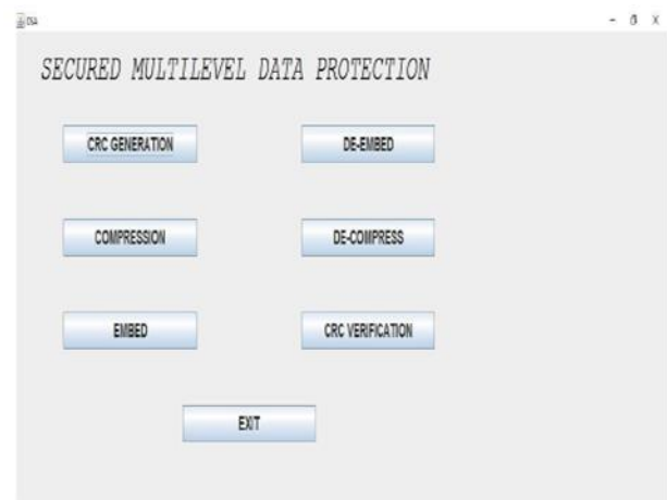
Fig. 3: User Main form