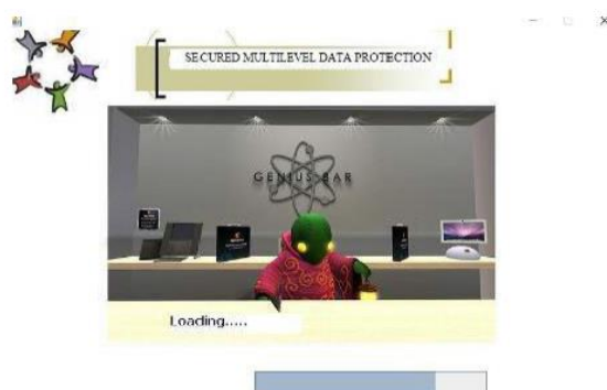
Fig. 1: Home pages for Secured Multilevel Data Protection