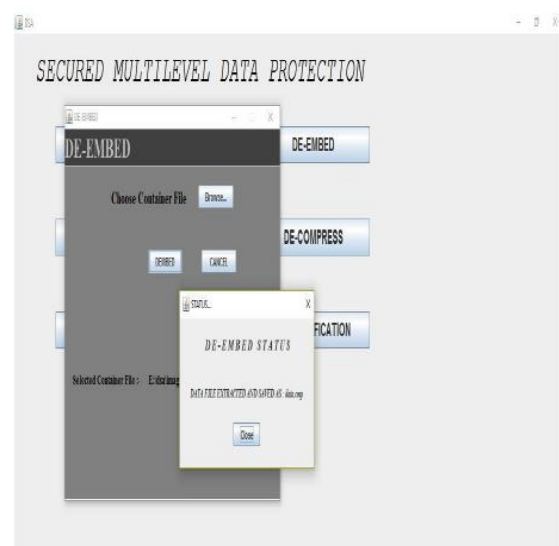
Fig. 4: Data De-embed status